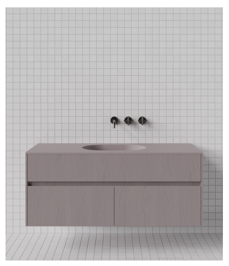
900mm Wide with Kubo Colour: Nude

1800mm Wide with double Lunar Colour: Sage