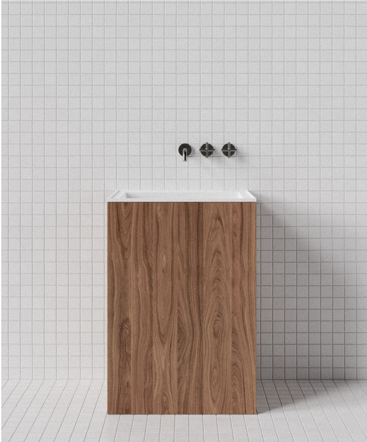
Saturn 600 Inset Basin by Thomas Coward